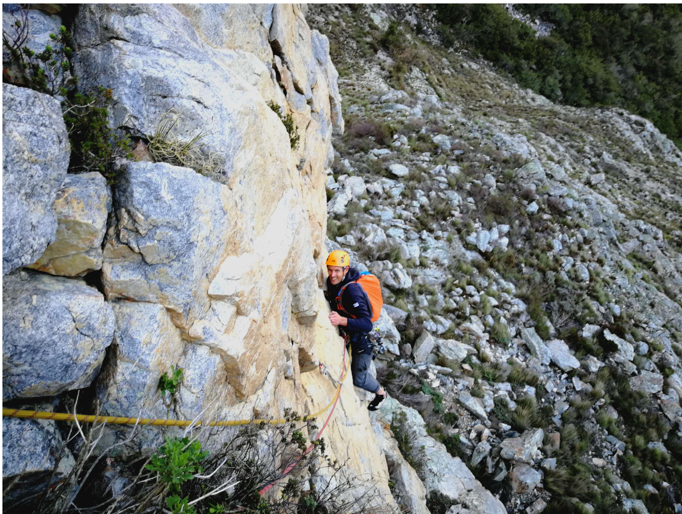
Brent Russel clinging on to the balance face of Pitch 1.